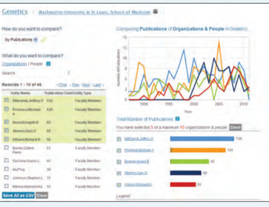
Temporal visualizations showcase grants and publications over time