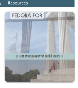
"We see Fedora as our repository service model that is scalable for all of our born digital and archival content. Fedora is a central part of our repository architecture." READ MORE