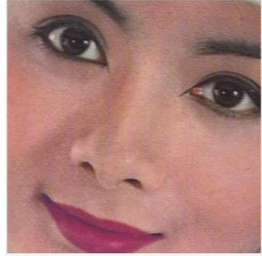
The Paul Kendel Fonoroff Collection for Chinese Film Studies