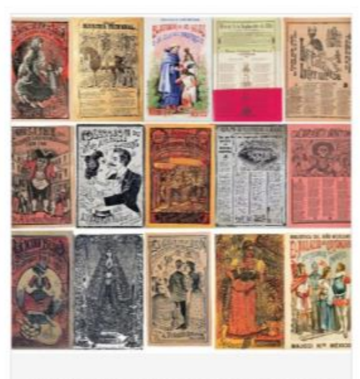
Illustrating Mexico one page at a time-Print Art of José Guadalupe Posada