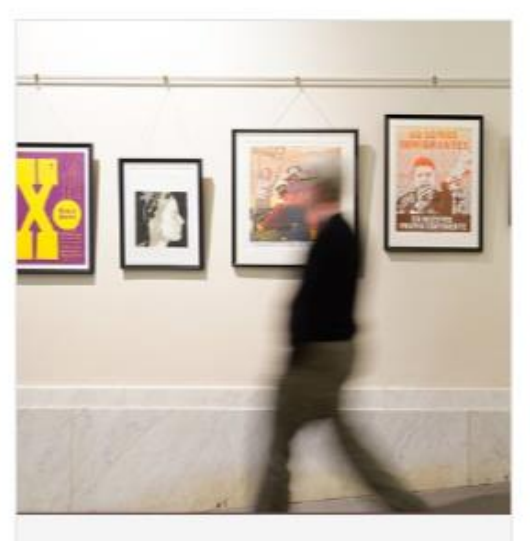
Art for the Asking: 60 Years of the Graphic Arts Loan Collection